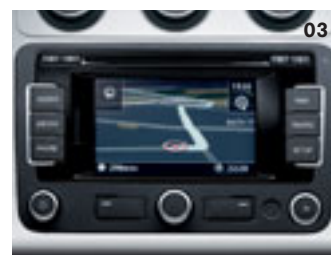
03 RNS 315 touch-screen navigation/radio system.

When it comes to in-car entertainment systems and communications packages, those looking to install a technologically advanced or upgraded system are spoilt for choice. Whether you require the latest touch-screen navigation system or digital radio receiver, these factory-fitted options provide the ultimate in advanced electronics, state-of-the-art technology and connectivity.