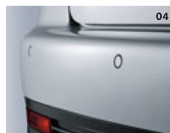
04 Rear parking sensors.

Safety and security have to be a primary consideration, for only when you are feeling totally safe and protected can you completely relax. For example, the rear parking sensors take the worry out of reversing into tight spaces, enabling you to enjoy the driving experience so much more.