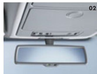
02 Automatic dimming interior rear-view mirror (Convenience pack).

The importance of comfort and convenience cannot be over-emphasised. Choose from this range of factory-fitted options to create an interior that meets your individual needs, and makes life just that little bit more comfortable and convenient. 2Zone electronic climate control, electric sunroof or Convenience pack, these luxuries are designed to help you relax and take the stress out of driving, adding not only a touch of luxury, but also providing invaluable practical assistance.