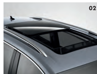
02 Panoramic sunroof.

The importance of comfort and convenience cannot be over-emphasised. Choose from this range of factory-fitted options to create an interior that meets your individual needs, and makes life just that little bit more comfortable and convenient. From headlight washers to cruise control, from a luggage net to a Winter pack, these luxuries are designed to help you relax and take the stress out of driving, adding not only a touch of luxury, but also providing invaluable practical assistance.