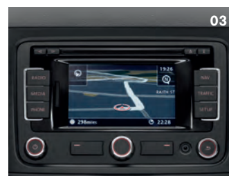
03 RNS 315 touch-screen navigation/radio system.

If you are looking to upgrade your radio system, these factory-fitted options provide the convenience and entertainment you need to help you enjoy your journey. Choose the system that best meets your needs, then sit back and enjoy the benefits.