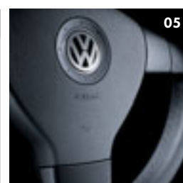
06 Leather trimmed steering wheel.

● Standard equipment ○ Optional equipment – Not available Factory-fitted options are subject to availability and extended delivery.