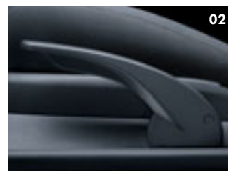
02 Driver's and front passenger's seat height adjustment.

The importance of comfort and convenience cannot be over-emphasised. Choose from this range of factory-fitted options to create an interior that meets your individual needs, and makes life just that little bit more comfortable and convenient. From 'Climatic' semi-automatic air conditioning to driver's and front passenger's seat height adjustment, from a sunroof to a Winter pack, these essential luxuries are designed to help you relax and take the stress out of driving, adding not only a touch of luxury, but also providing invaluable practical assistance.