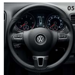
05 Multifunction steering wheel.

A multifunction leather trimmed steering wheel including Highline multifunction computer not only adds a touch of elegance and style, but enables you to control a diverse range of functions with the greatest of ease. Everything is to hand and intuitively where you would expect it to be, allowing you to drive in a totally relaxed manner, while enjoying all the benefits of advanced technology.