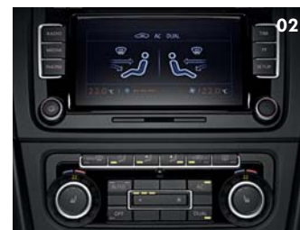
02 2Zone electronic climate control and RCD 510 touch-screen radio system.

The importance of comfort and convenience cannot be over-emphasised. Choose from this range of factory-fitted options to create an interior that meets your individual needs, and makes life just that little bit more comfortable and convenient. From 2Zone electronic climate control to a front centre armrest, from a sunroof to a Winter pack, these essential luxuries are designed to help you relax and take the stress out of driving, adding not only a touch of luxury, but also providing invaluable practical assistance.