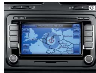
03 RNS 510 DVD touch-screen navigation/radio system.

When it comes to in-car entertainment systems and communications packages, those looking to install a technologically advanced or upgraded system are spoilt for choice. Whether you require concert hall acoustics or the latest navigation system, these factory-fitted options provide state-of-the-art technology and connectivity. Choose the system that best meets your needs, then sit back and enjoy the benefits.