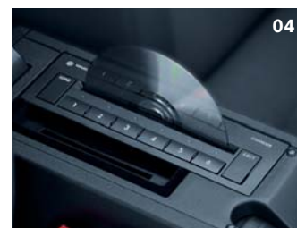
04 6 CD autochanger.

Whether you are looking to add a CD autochanger or iPod integration these factory-fitted options provide the ultimate in advanced electronics, state-of-the-art technology and connectivity. Choose the system that best meets your needs, then sit back and enjoy.