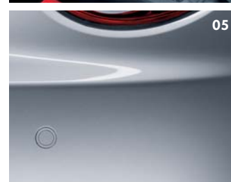
05 Rear parking sensors.

Safety and security have to be a primary consideration, for only when you are feeling totally safe and protected can you completely relax. For example, the rear parking sensors take the worry out of reversing into tight spaces.