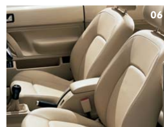
06 Leather upholstery.

The interior of your car is all about aesthetics and luxury, leather upholstery including heated front seats enables you to create a sumptuous interior that is tasteful, elegant and attractive, meeting your individual needs perfectly, and providing the highest levels of comfort and driving pleasure. Sit back, relax and enjoy your surroundings.