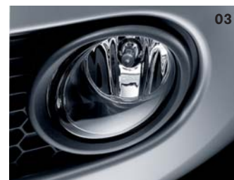
03 Front fog lights.

The exterior styling of a car is not only an expression of its personality, but makes a powerful statement about your own individuality and taste. These factory-fitted options provide an easy and effective way to create a striking visual appearance with great aesthetic appeal, while enjoying some important practical benefits. From Special paint to front fog lights, choose the options best suited to your needs and enhance not only your car's exterior looks, but your driving experience too.