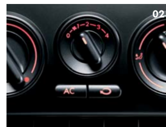
02 Manual air conditioning.

The importance of comfort and convenience cannot be over-emphasised. Choose from this range of factory-fitted options to create an interior that meets your individual needs, and makes life just that little bit more comfortable and convenient. From 'Climatic' semi-automatic air conditioning to cruise control, from carpet mats to a Winter pack, these luxuries are designed to help you relax and take the stress out of driving, adding not only a touch of luxury, but also providing invaluable practical assistance.