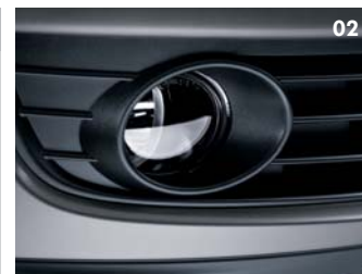
02 Front fog lights.

The exterior styling of a car is not only an expression of its personality, but makes a powerful statement about your own individuality and taste. These factory-fitted options provide an easy and effective way to create a striking visual appearance with great aesthetic appeal, while enjoying some important practical benefits. From heat insulating tinted glass to front fog lights, choose the options best suited to your needs and enhance not only your Jetta's exterior looks, but your driving experience too.