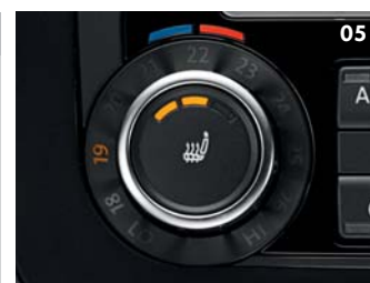
05 Heated front seats ('Vienna' leather upholstery).

The interior of your car is all about aesthetics and luxury, leather upholstery enables you to create a sumptuous interior that is tasteful, elegant and attractive, meeting your individual needs perfectly, and providing the highest levels of comfort and driving pleasure. Sit back, relax and enjoy your surroundings.