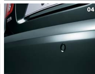
04 Parking sensors (Sensor pack).

Safety and security have to be a primary consideration, for only when you are feeling totally safe and protected can you completely relax. Whether you are looking to ensure the safety of your passengers, enhance rear safety or make life just that little easier, this range of safety and security features will help you protect passengers and make your Jetta more secure, enabling you to enjoy the driving experience so much more.