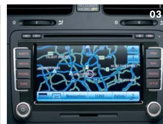
03 RNS 510 DVD touch-screen navigation/radio system.

When it comes to in-car entertainment systems and communications packages, those looking to install a technologically advanced or upgraded system are spoilt for choice. Whether you require upgraded acoustics or the latest DVD touch-screen navigation/radio system, these factory-fitted options provide the ultimate in advanced electronics, state-of-the-art technology and connectivity. Choose the system that best meets your needs, then sit back and enjoy the benefits.