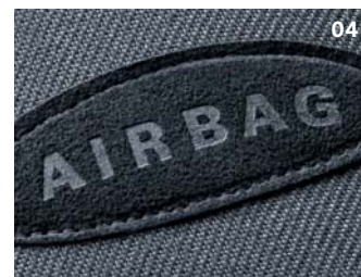
04 Side airbags.

Safety has to be a primary consideration, for only when you are feeling totally safe and protected can you completely relax. This choice of safety features will help you protect passengers and keep your Fox stay safely on course, enabling you to enjoy the driving experience so much more.