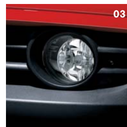
03 Front fog lights.

The exterior styling of a car is not only an expression of its personality, but makes a powerful statement about your own individuality and taste. These factory-fitted options provide an easy and effective way to create a striking visual appearance with great aesthetic appeal, while enjoying some important practical benefits. From the colour pack to front fog lights, choose the options best suited to your needs and enhance not only your Fox's exterior looks, but your driving experience too.