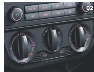
02 'Climatic' semi-automatic air conditioning.

The importance of comfort and convenience cannot be over-emphasised. Choose from this range of factory-fitted options to create an interior that meets your individual needs, and makes life just that little bit more comfortable and convenient. From 'Climatic' semi-automatic air conditioning to easy entry sliding seats, from a sunroof to a Luxury or Winter pack, these essential luxuries are designed to help you relax and take the stress out of driving, adding not only a touch of luxury, but also providing invaluable practical assistance.