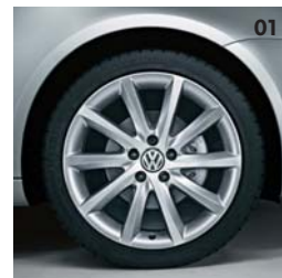
01 'Samarkand' 8J x 18 alloy wheels.

Add a touch of style and personality with this great choice of alloys. Alloys add a distinctively sporting look to your car, carefully chosen to enhance the exterior styling of every model, these options give you plenty of opportunity to express your individuality and transform the appearance of your Eos.