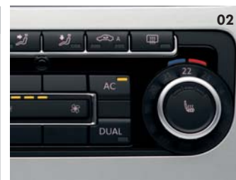
02 2Zone electronic climate control.

The importance of comfort and convenience cannot be over-emphasised. Choose from this range of factory-fitted options to create an interior that meets your individual needs, and makes life just that little bit more comfortable and convenient. 2Zone electronic climate control, wind deflector or winter pack, these essential luxuries are designed to help you relax and take the stress out of driving, adding not only a touch of comfort, but also providing invaluable practical assistance.