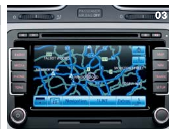
03 RNS 510 DVD touch-screen navigation/radio system.

When it comes to in-car entertainment systems and communications packages, those looking to install a technologically advanced or upgraded system are spoilt for choice. Whether you require concert hall acoustics, the latest navigation system or a digital radio receiver, these factory-fitted options provide the ultimate in advanced electronics, state-of-the-art technology and connectivity. Choose the system that best meets your needs, then sit back and enjoy the benefits.